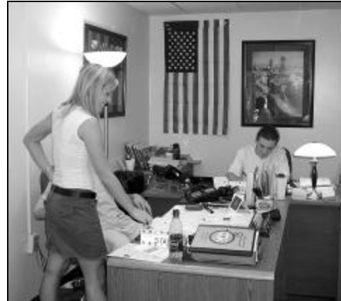
SGA executive officers work in their office.